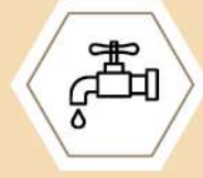
Pure Drinking water