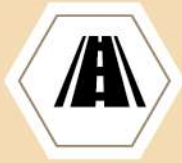
40 FT BT ROADS