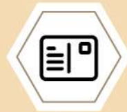
Name & Number Display Board