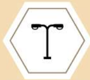
Designer LED Street Lights