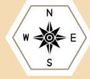
100 & vastu